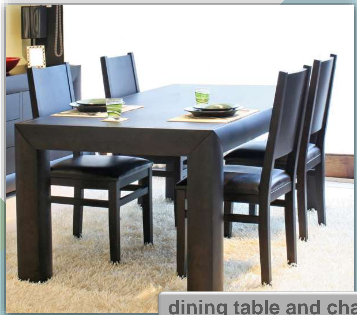
dining table and chairs