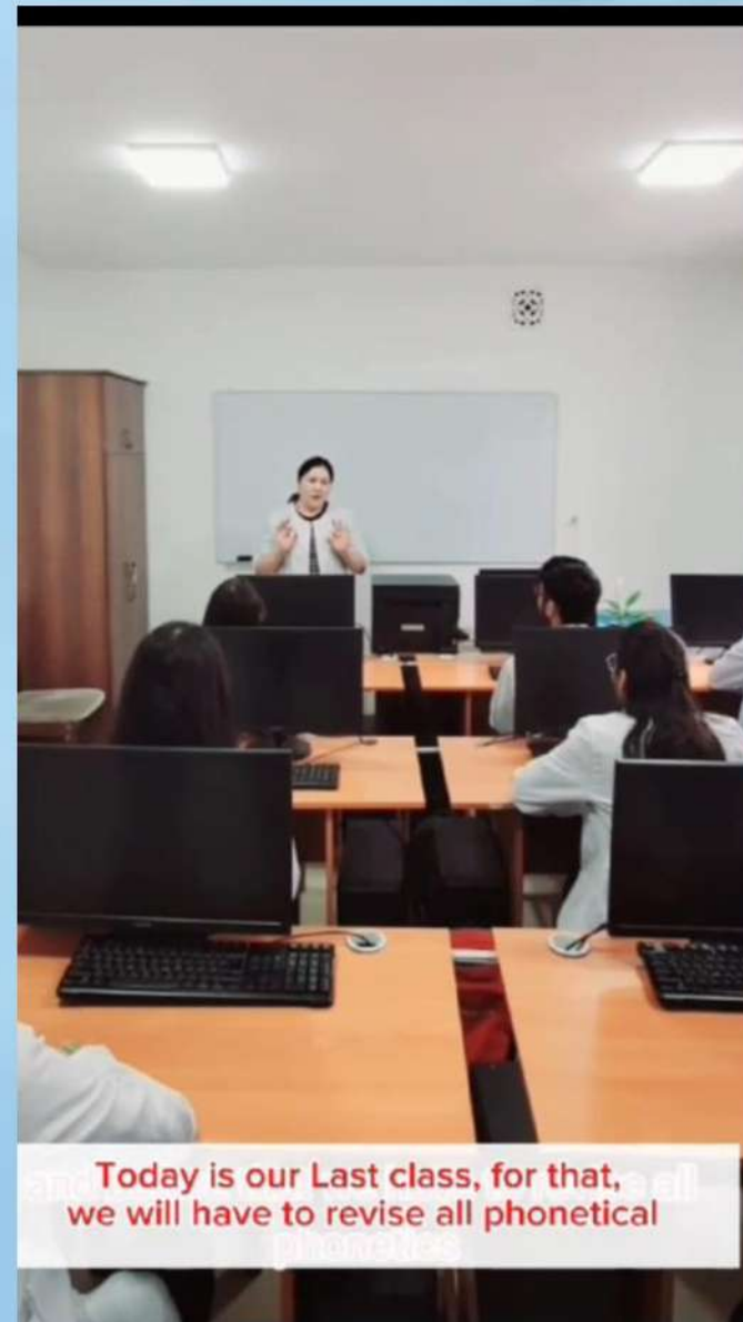
Today is our Last class, for that, we will have to revise all phonetical